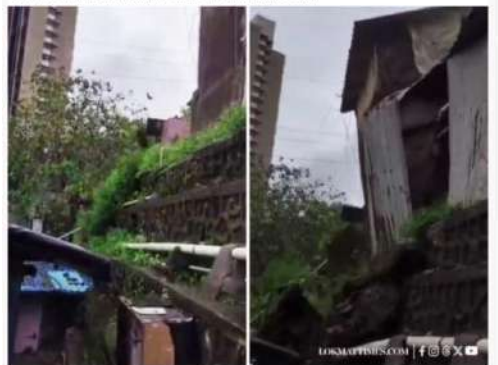
Mumbai Rains: Wall Collapses on Shanties in Chembur Amid Heavy Rainfall (Watch Video)